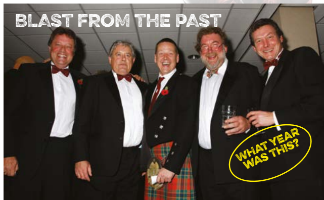
BLAST FROM THE PAST