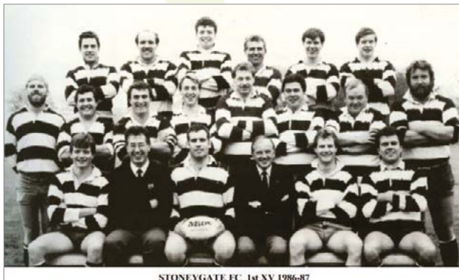
STONEYGATE FC 1st XV 1986-87