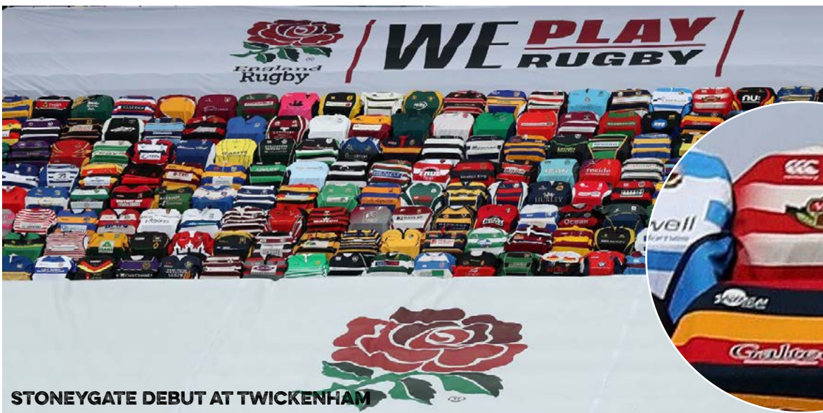
STONEYGATE DEBUT AT TWICKENHAM