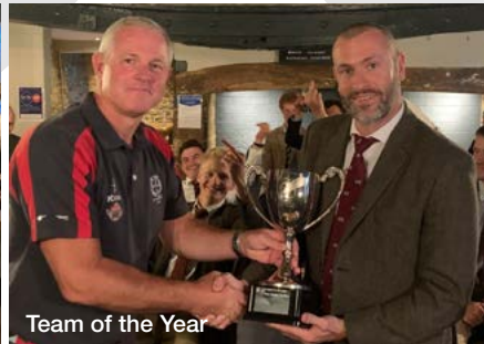
Team of the Year